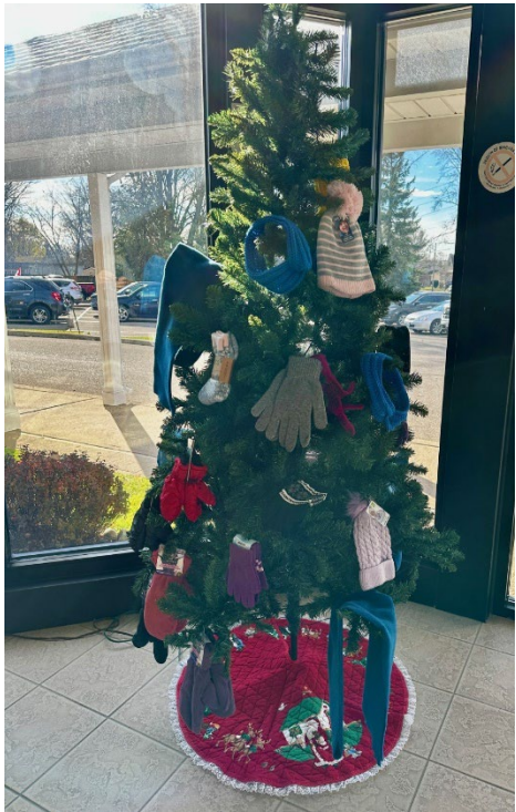
The Mitten Tree in the foyer will be taking donations until Dec. 12.